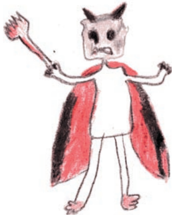
Drawn by an 8-year-old-boy

We recommend a minimum of three hours of pre-implementation staff training and at least two hours of post-implementation supervision and debriefing.