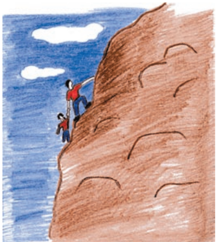
Drawn by a 13-year-old-boy