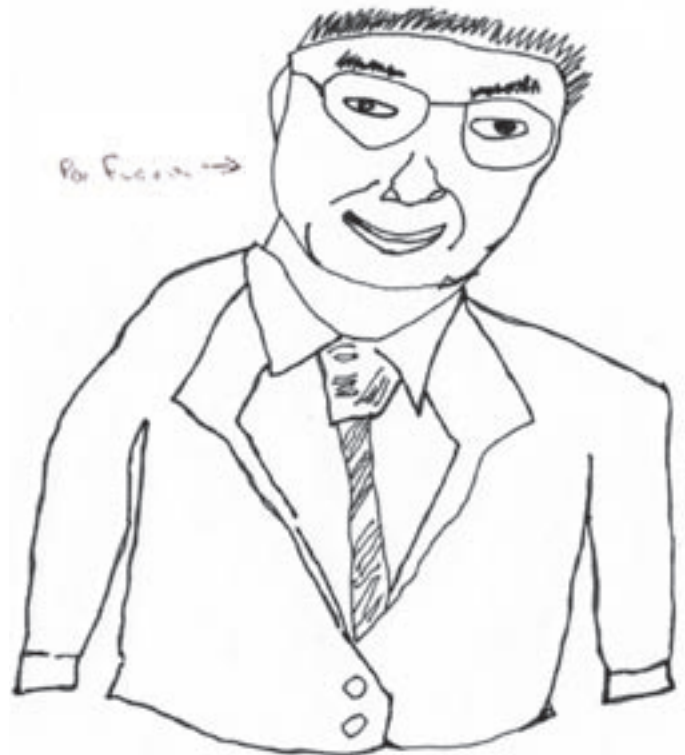
Drawn by a 14-year-old-boy; text in drawing reads "on the the inside" (left) and "on the outside" (right)