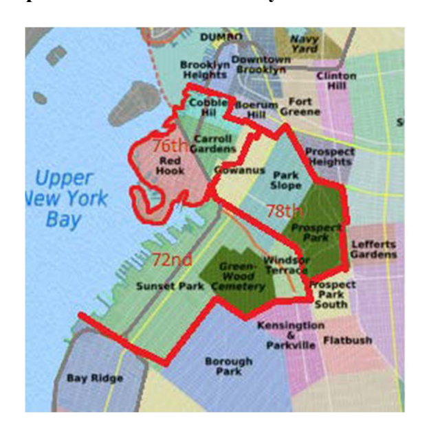
Figure 1.1. Map of Red Hook Community Justice Center Catchment Area

not only the Red Hook community but also two other adjacent police precincts (see Figure 1.1, catchment area indicated by bold outline).