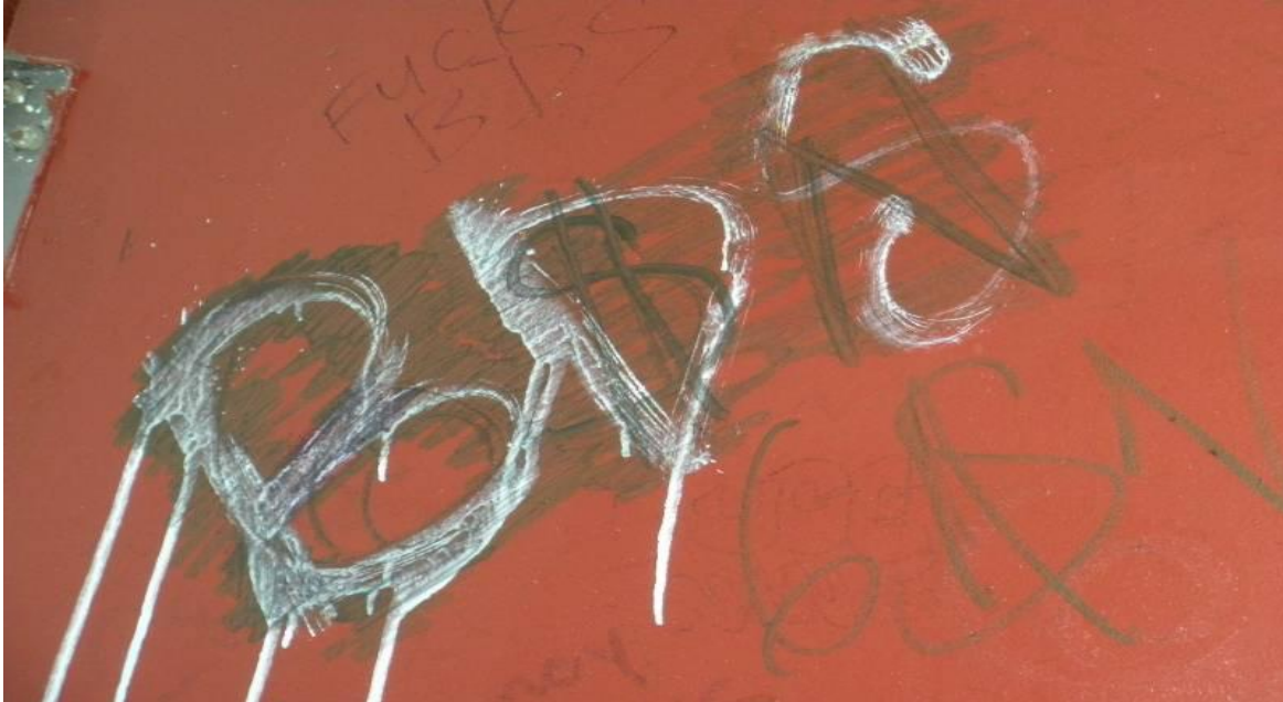
Table 4 Sample East Harlem Gang Tag

On social networking sites, these “graffiti” genres take the form of text-based posts or photographs layered with text and symbols. In many ways, “tagging” a Facebook “wall” is easier than writing graffiti on the street where quality-of-life policing strategies and anti-graffiti programs disrupt such illegal activity.