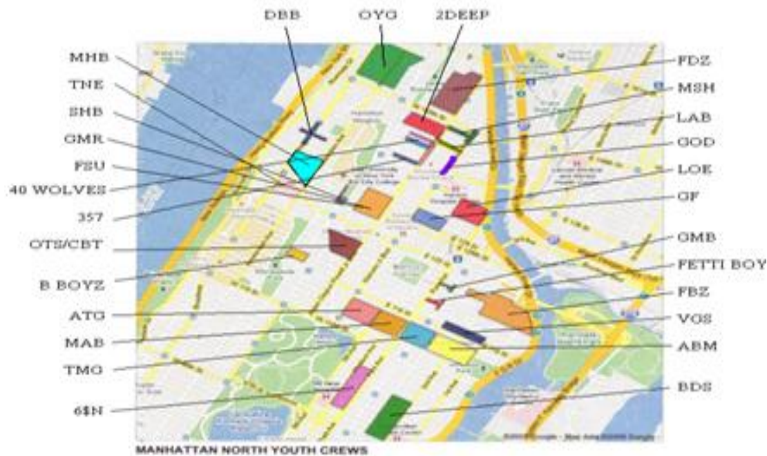
Table 2 - NYPD 2010 Map of Youth Gangs or "Crews" in Upper Manhattan

The New York City Police Departments, 23 rd and 25 th Precincts, and Public Service Area 5, which is responsible for public housing developments, together cover the East Harlem community. The NYPD reports that East Harlem alone is home to at least 13 active juvenile gangs, most of which are geographically organized and identify themselves by three letter acronyms. Seven of the 13 gangs are in the 23 rd Precinct; six are in the 25 th Precinct. Juvenile gang members are predominantly African-American and Latino and native born, although there are a small but growing number of recent gangs comprised of immigrants from Mexico and Central America.