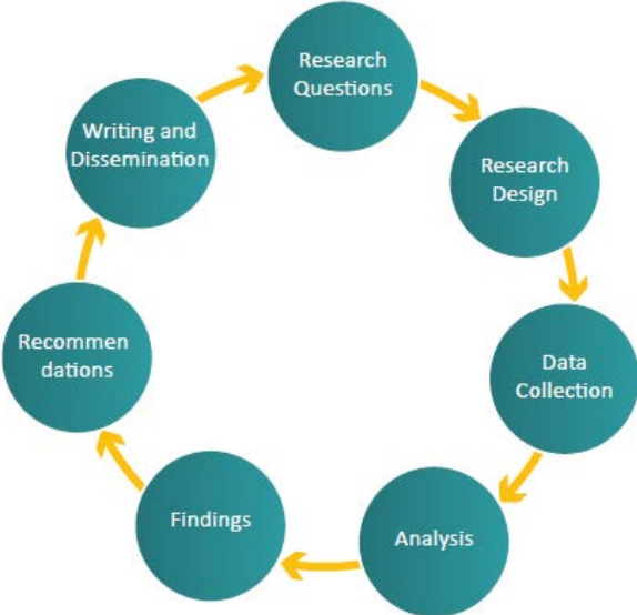
Figure 1: Research Process

For example, when evaluating a reentry program, participants who have recently completed the program, people who were formerly incarcerated, or their family members could lead some of the data collection strategies. If the research involves surveys, interviews, or focus groups with program participants and staff—for example, to learn what people like about the program, what additional supports are desired, or why people are dropping out or staff members are leaving—participatory researchers could take the lead on collecting those data. Their intimate knowledge of the program or field may help the evaluation team collect richer data because they may ask more relevant follow-up questions or because research participants may be more open and honest in their responses, knowing that the person administering the survey or facilitating the focus group is a “credible messenger” and can relate to their experience.