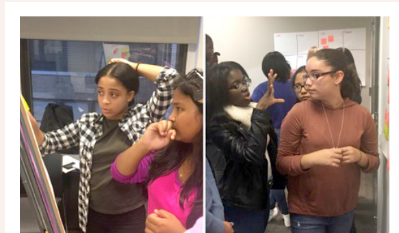
Youth Justice Board members learn about New York City government during their training.