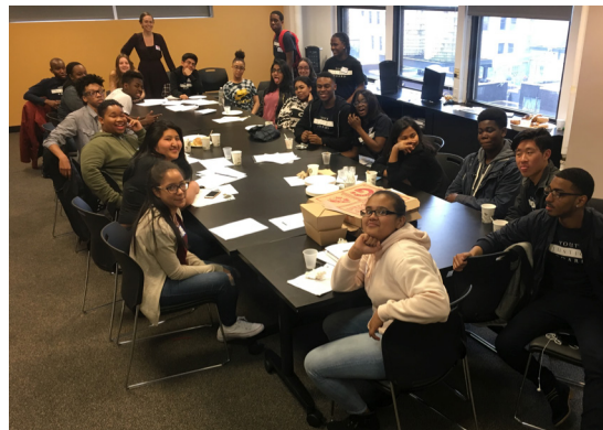
Youth Justice Board members debrief after a successful focus group.

We want our report to call stakeholders and people in power to action. Any emotions evoked by the experiences of homeless youth as well as the information provided by our recommendations will spread awareness and begin further discussions about the issue. Thank you for taking the time to read our report!