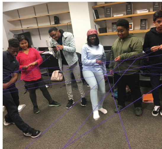
Youth Justice Board members have fun with a team-building affirmations activity.

building computers, robots, studying gaming software, and making music through music production software. He has benefitted from joining the Youth Justice Board by learning interview, social, and public speaking skills. The Youth Justice Board has opened up a new perspective for him, and he one day wishes to incorporate the hobbies he loves to make an impact on society.