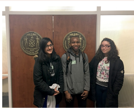
Board members visit the Manhattan District Attorney’s office to learn more about the role of housing in criminal court cases.

The city has additional vouchers that homeless youth might apply for, but current voucher requirements often make them inaccessible for homeless youth. For example, some vouchers require youth to live without any roommates or with only one roommate, and pay their entire portion of the rent independently. Hofmeister described these expectations as “unrealistic” for youth and said that adjusting the voucher requirements could help more homeless youth access safe apartments. Young people who are not homeless often live in shared apartments with roommates to defray the cost of living; youth who are homeless but seeking to use vouchers to supplement their rent payments should be allowed to as well.