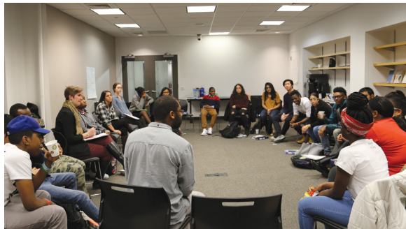
Youth Justice Board members discuss youth-adult partnerships with Center for Court Innovation staff.