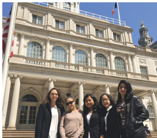
Youth Justice Board members and staff visit New York City Hall for a meeting with the Children’s Cabinet.