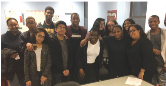
Members of the Youth Justice Board visit the Queens Youth Justice Center.

We are grateful to the 25 young people who shared their opinions and experiences during our focus groups.