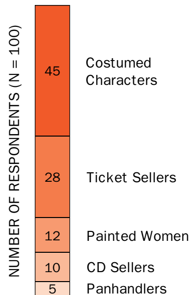
PROFESSION OF SURVEY RESPONDENTS

The goals of the survey were to understand the needs of this population and, in turn, to recommend targeted interventions and services that Midtown might build into its programming. This survey was not designed to elicit perceptions and perspectives of the public, law enforcement, and others who may have different views. One hundred Times Square workers were surveyed in June and July 2016.