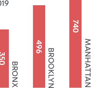
1,586 paricipants were served by Project Reset in 2019