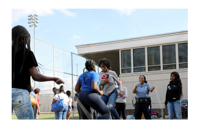
School safety officers play with students at the Restorative Justice in Schools Fall Carnival at Brooklyn's Tilden High School.

our peacemaking programs draw. Applying similar principles, our UPNEXT program holds restorative circles with fathers, allowing them to explore and reflect on notions of fatherhood while building supportive networks that extend beyond the classroom. RISE (Reimaging Intimacy through Social Engagement) is a new initiative that seeks to combat gun violence and initimate partner violence. In 2019, RISE engaged over 5,000 New Yorkers in trainings, workshops, and community healing events. Our Driver Accountability Program builds on our restorative justice work,